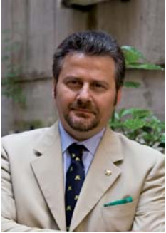
Roberto Ciambetti REGIONAL MINISTER OF BUDGET, LOCAL AUTHORITIES AND ERDF PROGRAMS