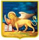
REGIONE DEL VENETO